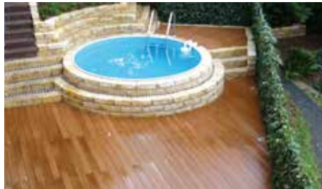
private house | Dresden