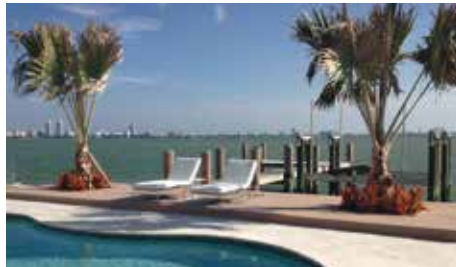
sun deck | Miami Beach