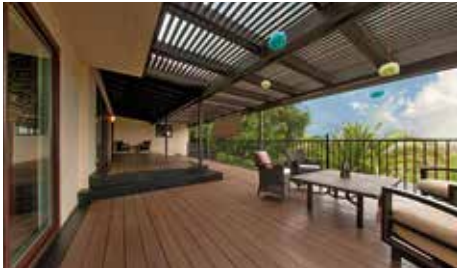
Deck | Riverside, CA.

All its very exceptional properties make Resysta extremely resistant to weather influences like sun, rain, snow and ice, salt- and chlorine-water. Resysta does not swell, crack, splinter or rot. We provide a limited warranty up to 25 years in residential applications and up to 15 years for commercial.