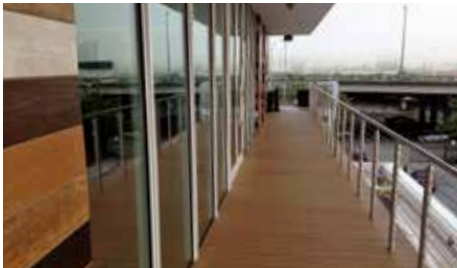
Balcony | Miami, FL.