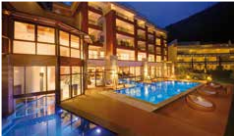
outdoor hotel facility | Meran