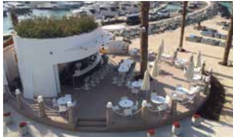
Deck | Middle East