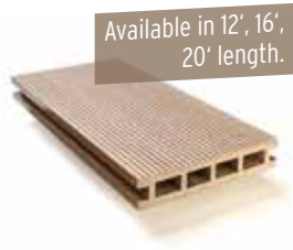
RESO10612 PLATINUM (W x H x L) 1" x 5 1/2" x 12'