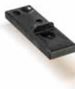
RESCLIPHF100 FACADE Clip