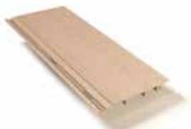
RESCP120412 4" Siding (W x H x L) 1/2" x 4" x 12'