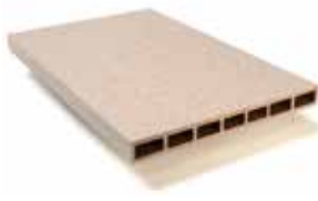
RESP340812 7CH Cladding (W x H x L) 13/16" x 7 3/4" x 12'