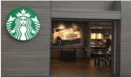
Coffee Shop | Brooklyn, NY

All its very exceptional properties make Resysta extremely resistant to weather influences like sun, rain, snow and ice, salt- and chlorine-water. Resysta does not swell, crack, splinter or rot. We provide a limited warranty up to 25 years in residential applications and up to 15 years for commercial.