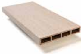
RESP340612 4CH Cladding (W x H x L) 13/16" x 5 1/2" x 12'