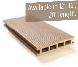
RESO10612 PLATINUM (W x H x L) 1" x 5 1/2" x 12'