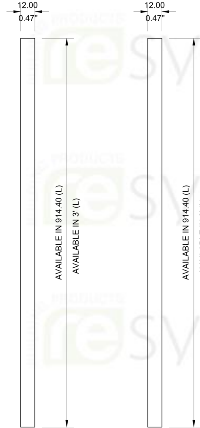
3 PLAN D-8 SCALE 1:2