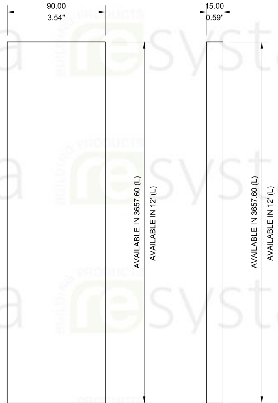
3 PLAN C-7 SCALE 1:2